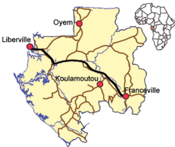
Figure 1. Towns in the influenza sentinel network in Gabon. Libreville was chosen as a typical urban community; Franceville, in the southeast, represents a savannah/forested rural region of 100,000 inhabitants; and Oyem (35,241 inhabitants) and Koulamoutou (16,270 inhabitants), in the north and south, respectively, represent forested rural regions.

Epidemiologic data (name, age, sex, and travel history during the month before onset) and clinical data were collected for each patient. Nasal swabs were sent each week to Centre International de Recherches Médicales de Franceville for analysis. Real-time reverse transcription PCR (RT-PCR) was used to detect pH1N1, seasonal influenza A (H1N1 and H3N2), and seasonal influenza B viruses (12). Specimens positive for pH1N1 virus were also tested by specific quantitative PCR for the following common respiratory viruses: adenovirus,