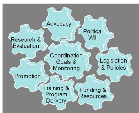
Figure 2 The breastfeeding gear model for scaling up and sustainability of breastfeeding programs.

Scale up has been attained through extensive use of health communications strategies and massive professional and paraprofessional training/education efforts based on cascade training models. Scale up requires a high degree of intersectoral coordination, usually at the national and local levels, based on a flexible decentralized structure, and sustainability requires the availability of low-cost and rapid-response monitoring and evaluation systems. This conclusion is fully consistent with the