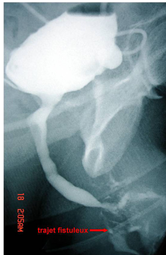
Figure 2 Urinary retrograde and voiding urethrocytography shows an anterior narrowing of the urethra with infiltration of the contrast agent in the sinus trajectory.

prostate volume was normal with a soft consistency. His prostate volume was normal with a soft consistency.