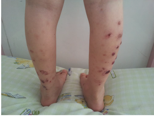
FIGURE 1: Palpable purpura and hemorrhagic bullae on both lower extremities.

pain. There was no history of reduced urine output, visible blood in the urine, or black stool. The case had taken no medication and had no history of upper respiratory tract infections or animal/insect bites for at least 1 month prior to the onset of rashes.