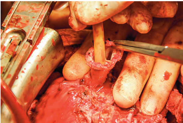
Figure 2: HA5 sewing ring hat removed.

The HVAD was inserted into the sewing ring and locked into place. The driveline was tunnelled subcutaneously to the left lower abdominal quadrant avoiding the previous driveline tunnel on the right side.