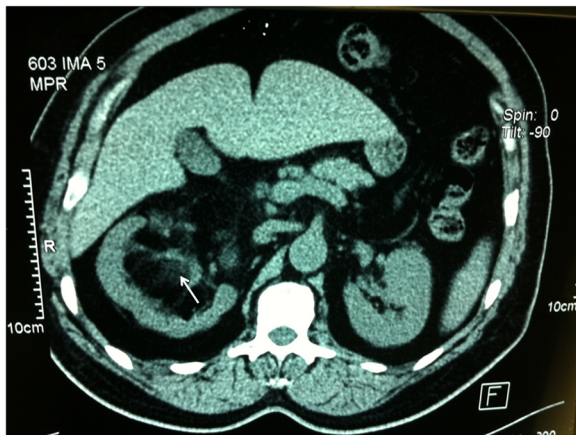
Figure 1 Computed tomography of the abdomen and pelvis showing parenchymal mass of fat density of the right kidney (arrow).