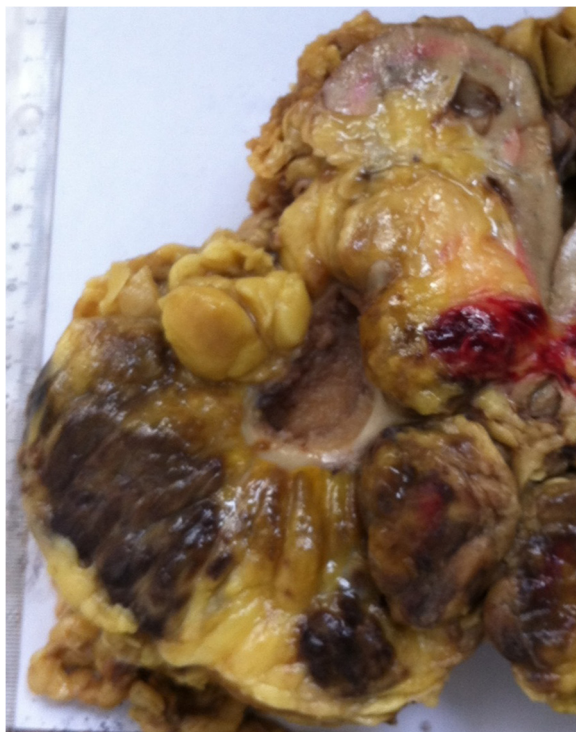
Figure 2 Gross photograph of the well-circumscribed solid tumor of the right kidney (coronal slice). The cut surface shows areas of soft yellow fatty tissue admixed with areas of red-brown friable tissue.

hematopoietic cell lineages (granulocytic, erythroid and megakaryocytic) was observed (Figure 4). Scattered small lymphoid aggregates and foci of hemorrhage were noted. No adrenal rests were found. Based on this histomorphology, a hematological investigation including bone marrow aspiration was performed to rule out any underlying hematological disorders. Bone marrow aspiration was normocellular. Based on these findings, renal myelolipoma was diagnosed. The patient had an uneventful postoperative course and has remained disease free at 3-month follow up.