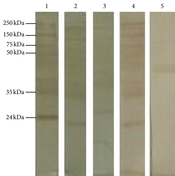
FIGURE 2: Western blotting results for sera sample of the study population. Lane 1: reference ladder; lanes 2–4: sera testing positive by ELISA; Lane 5: Toxocara -negative control.

seropositive for Toxocara , seven cases (70%) were males. However, this was not higher than the overall proportion of the male epilepsy patients of 64.7 percent. Toxocariasis is seen more frequently among children or young adults probably due to more frequent contact with infective eggs or by the ingestion of encapsulated larvae contained in the raw tissues of paratenic hosts, such as cows, sheep, or chicken. In the present study, we did not observe any significant difference between either of the seropositive and seronegative epileptic patients in terms of rural and urban populations and also various age groups. The seropositivity was not affected by age, although there were significantly more seropositive epilepsy patients who were students.