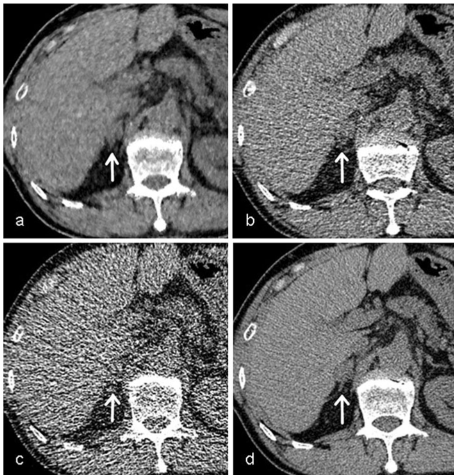
Figure 3 The adrenal nodule in each CT image. An adrenal nodule with 20 mm in longest diameter (white arrow) in axial unenhanced CT images of UL-MBIR (a), L-ASIR (b), UL-ASIR (c) and R-FBP (d) of a 65-year-old man weighing 61 kg. In UL-ASIR (c), the margin of this adrenal nodule is obscure due to the prominent image noise. The certainty level (UL-MBIR/L-ASIR/UL-ASIR) for this lesion by each reader was 4 (lesion definitely present)/3(lesion probably present)/3 by reader 1 and 3/3/0(no lesion) by reader 2, respectively.