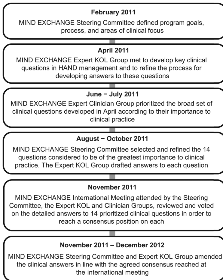
Figure 1. Overview of the Mind Exchange program. Abbreviation: KOL, key opinion leader.

For each question, a draft practical answer was generated by 2 or 3 members of the core expert group based on the findings of the literature review and their clinical opinion. Answers were reviewed by the steering committee and refined by the expert group. Following this, an international meeting with the steering committee, core expert group, and broader HIV clinician group was held to discuss and further refine the draft answers. These 63 participants from 30 countries voted on