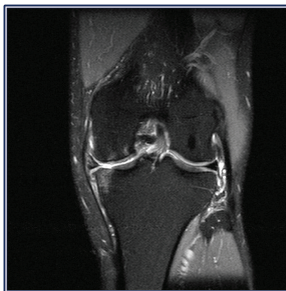
Figure 3 Magnetic resonance imaging of the left knee demonstrating a medial meniscal tear, herniation from the joint space with bone edema within the medial tibial plateau, and osteochondral damage on the medial femoral articular surface.

unstable chondral femoral flap. The patient returned 3 months later reporting that knee joint catching had improved although medial pain in extension during weight-bearing activity persisted. He also reported discomfort when walking distances and stated that he could not return to tennis because