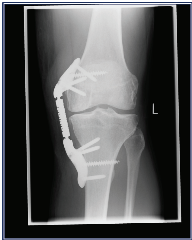
Figure 4 Weight-bearing radiograph of left knee demonstrating successful initial KineSpring® System.

The patient underwent implant with the KineSpring System in July 2011. Arthroscopy was undertaken prior to implant, which confirmed grade 4 lesions on the medial femoral condyle and the medial tibial plateau. The KineSpring procedure followed standard techniques that have been described elsewhere 11 and was uneventful (Figure 4). The patient remained hospitalized for 2 days following the procedure. Although he was allowed to bear partial body weight and perform gentle range of motion exercises, he was instructed to walk with crutches for 2 weeks to encourage wound healing. The patient reported immediate arthritic pain relief in the postoperative period. At the 2-week follow-up, the wound was fully healed and range of motion was 90 degrees. He was encouraged to engage in only light