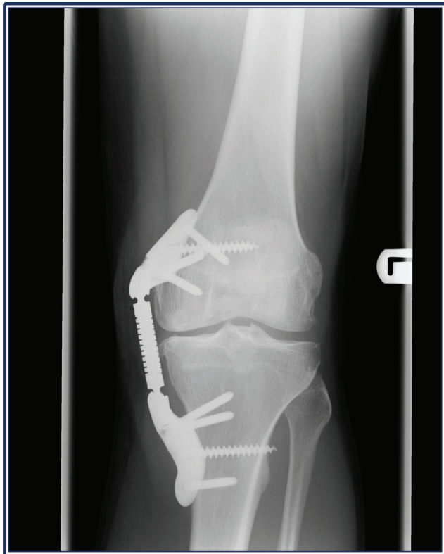
Figure 5 Weight-bearing radiograph of left knee demonstrating successful KineSpring® System following two-stage revision procedure.

with no complications. Postoperatively, the patient was instructed to gradually increase ambulation with the assistance of crutches while using minimal knee bending. The patient returned for follow-up visits weekly, which included visual inspection and microbial swabs of the wounds, until complete wound healing was realized. At 6 weeks, there was no evidence of infection, the wounds were well healed, and radiographs were unremarkable. At 3 months, the patient reported no wound problems, complete resolution of arthritic pain, and 120 degree range of motion with normal ambulation. Despite residual muscle weakness, the patient regularly engaged in moderate physical activity including walking, cycling, and tennis with no reported complications, pain, or joint dysfunction.