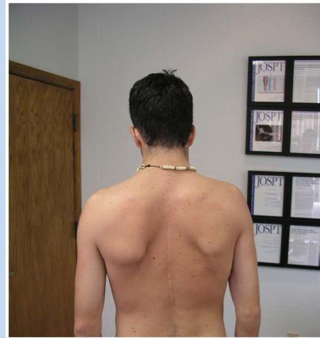
Figure 1. Example of scapular pathology seen in an elite junior tennis player with medial elbow pain on clinical examination.

Professional throwing athletes have significantly greater wrist flexion and forearm pronation strength on the dominant arm (15%-35%) compared with the nondominant extremity with no difference in wrist extension or forearm supination strength between extremities. 21 In professional baseball pitchers, there is 10% to 20% greater elbow flexion strength