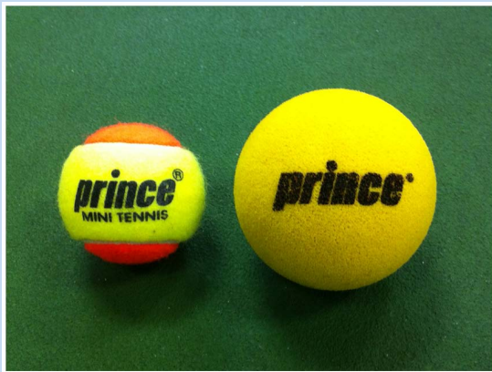
Figure 7. Examples of low-compression tennis balls that can be used to decrease impact shock during the interval tennis program. These balls are available commercially.

Interval sport return programs utilize alternate days, gradual progressions of intensity, and repetitions of sport activities. For the interval tennis program, low-compression tennis balls decrease impact stress and increase the tolerance of activity (Figure 7). Supervision of the interval program allows for biomechanical evaluation and guards against overzealous intensity levels, a common mistake in well-intentioned, motivated patients. The alternate-day return program, with rest between sessions, enhances recovery and decreases reinjury. 21,23,79