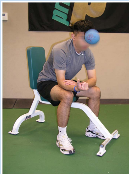
Figure 6. Wrist flips using a plyo ball to improve wrist and forearm strength.