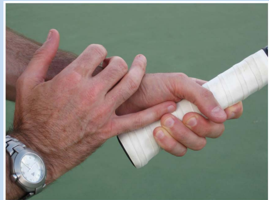
Figure 8. Use of the contralateral fifth digit to gauge proper grip size. The width of the fifth digit should fit between the longest finger and the thenar eminence in an optimally sized tennis racquet grip.

The principles of surgical intervention are total excision of the unhealthy pain producing angiofibroblastic tendinosis tissue, enhancement of vascular access to the surgical site, and preservation of normal tissue. 51 Techniques that fail to identify