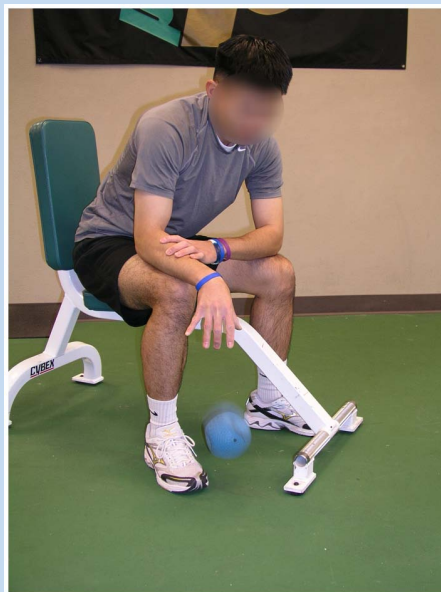
Figure 5. Wrist snaps using a plyo ball to improve wrist and forearm strength.

When the patient tolerates the distal isotonic exercise progression pain-free (3-5 lb or medium elastic tubing or bands) and oscillatory-type exercises, he or she progresses to isokinetic and plyometric exercise (Figure 4). Contractile velocities ranging between 180° and 300° per second with 5 or 6 sets of 15 to 20 repetitions are used to foster local muscular endurance 25 in athletic patients with slower contractile velocities (120° to 210° per second). Plyometric wrist snaps (Figure 5) and wrist flips (Figure 6) train the active elbow for functional and sport-specific demands. 79