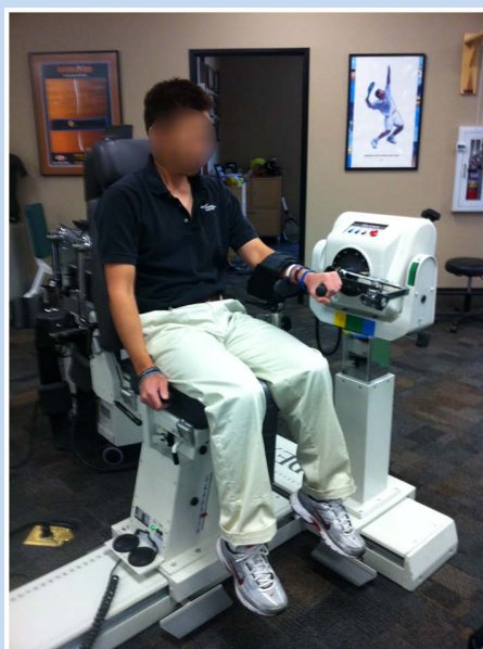
Figure 4. Isokinetic wrist extension/flexion exercise setup used during rehabilitation of humeral epicondylitis.

units of the elbow, forearm, and wrist using a combination of shoulder, elbow, wrist, and forearm positions. 21