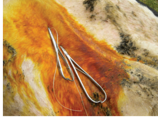
FIGURE 3: Fixation of Grymer/Sterner suture with two needle holders.

Roll-and-Toggle-Pin Suture Procedure [5, 6]. The cow is cast, restrained in right lateral recumbency, and then carefully rolled into dorsal recumbency (Figure 1). Percussion and auscultation of the body wall between the umbilicus and xyphoid for detection of a “ping” reveals the location of the abomasum and the site of trocarization. In the region of the loudest “ping,” usually on the right side of the ventral midline, a trocar cannula [4] is inserted through the abdominal wall into the abomasum, avoiding the subcutaneous abdominal vein. The trocar is then removed with the cannula left in place. Perforation of the abomasum is suggested by the