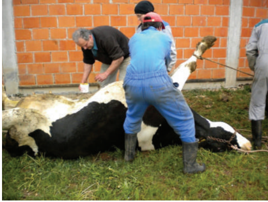
FIGURE 1: The cow is cast, restrained in right lateral recumbency, and then carefully rolled into dorsal recumbency.