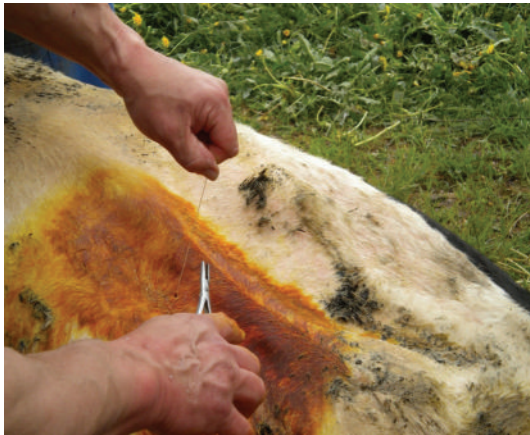
FIGURE 2: A bar suture is placed in the cannula and pushed into the abomasal lumen with the trocar. The cannula and trocar are then removed, leaving the suture in place.

of normal, milk yield below normal, lying down on right side, rumen rate decreased, rumen sounds present but muffled, feces scant and pasty, mild dehydration, and ping effect over left abdomen.