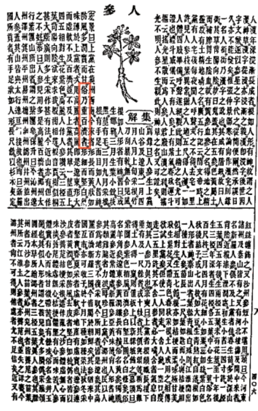
Fig. 5. The description of ginseng in the Bencao Gangmu, which explains the origin of ginseng. Baekje (百濟) represents the Baekje Dynasty, which governed the western part of the Korean Peninsula from 18 BC to AD 666.

Although the pharmacological activities of ginseng were described in the Shennong Bencao Jing, illustrations of the variety of ginseng used at that time were not provided. The Bencao Gangmu described ginseng used