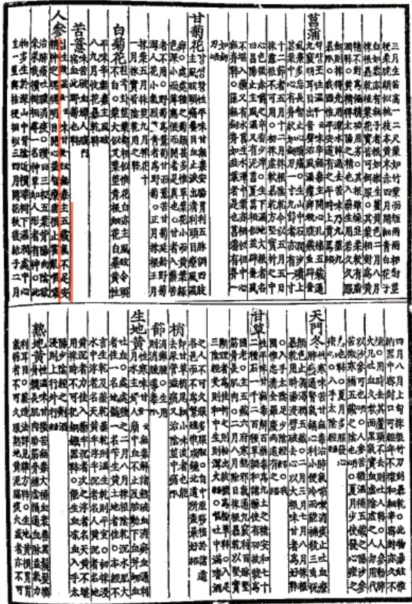
Fig. 4. The description of ginseng in the Donguibogam (東醫寶鑑), which explains the function of ginseng. The Donguibogam also describes additional activities of ginseng as well as the functions listed in the Bencao Gangmu.

to the World Heritage List in 2009 by UNESCO, also described the activities of ginseng, including those described in the Shennong Bencao Jing (i.e., the use of ginseng to cure general weakness, acute vomiting with diarrhea [cholera], hiccups and vomiting, atrophic lung disease and phlegm) (Fig. 4). In addition to the aforementioned texts, many published works have described similar activities. Therefore, P. ginseng was likely considered a medicinal herbal for the treatment of general weakness, acute vomiting with diarrhea, anxiety or mental health. It is unclear whether ancient medical practitioners such as Shizhen Li (李時珍), Zhong Jing Zhang (張仲景), or Jun Heo (許浚) knew the functions of ginseng. However, the pharmacological activities listed in historical documents are also supported by recent experimental and clinical studies (vide infra).