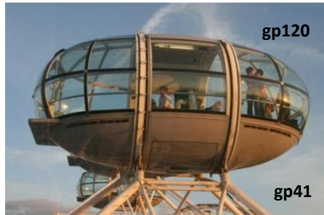
Figure 1. The London Eye as a 'model' of HIV. (a) The model depicts the diploid RNA genome and the outer envelope of the HIV particle composed of a lipid bilayer studded with glycoprotein spikes. (b) Close-up of trimeric spike showing globular gp120 and transmembrane gp41.