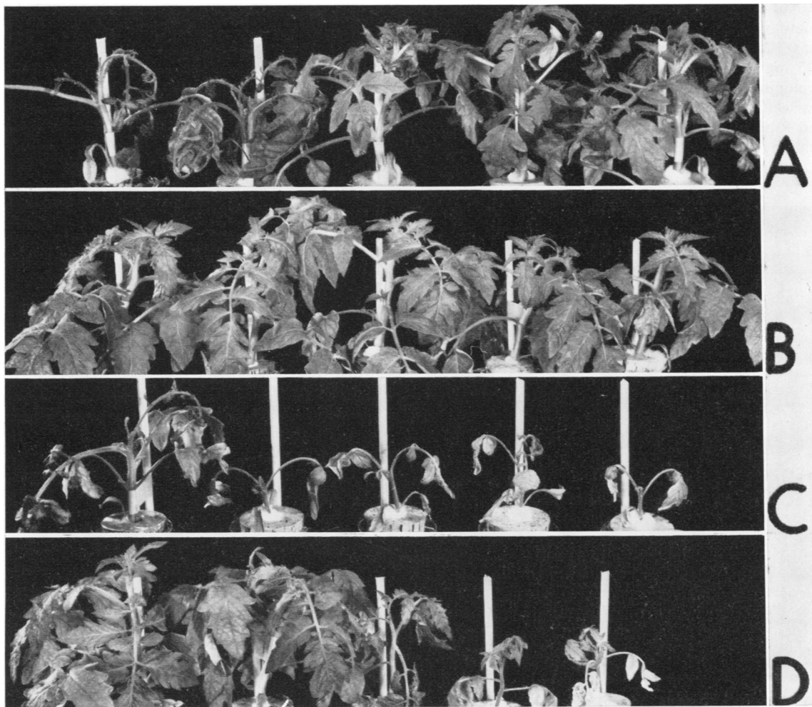
FIG. 1. Growth response of T3238 and Rutgers tomato to increasing B in nutrient solutions (1A and 1B) mg/liter: 0.06, 0.12, 0.35, 0.47, and 0.82; and to the same concentrations of Ge (1C and 1D) containing 0.06 mg/liter of B in all treatments. T3238 (1A) required more B for growth than Rutgers (1B), and T3238 (1C) developed B-deficiency symptoms on all Ge treatments. Ge was toxic to growth of Rutgers (1D) at the three highest Ge concentrations.

While working with two tomato cultivars that differentially absorb and translocate B, we found that Ge apparently does