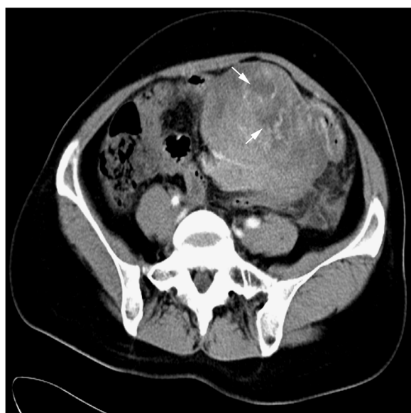
Figure 1 Preoperative computed tomography (CT) scan of the mesenteric mass. Contrast-enhanced CT demonstrating a poorly circumscribed solid mass with mild heterogeneous enhancement located at mesentery and showed adhesions of wall of jejunum. The multiple irregular hypointensity areas were observed in the mass and considered to be necrotic areas (white arrow).

A 38-year-old female patient presented with complaints of abdominal pain and abdominal distension that had persisted 3 days before admission to our hospital. Physical examination showed local tenderness and rebounding pain in the left abdominal region, and decreased bowel sounds. The laboratory results, including blood count, differential, liver and renal function, were within the normal range. There was no fever, weight loss and no palpable lymphadenopathy or organomegaly. A computed tomography (CT) scan showed a poorly circumscribed solid mass (9.9 cm × 8.6 cm × 7.1 cm) with mild heterogeneous enhancement located in the left upper abdominal region with adhesions of wall of jejunum. There was hypointensity areas observed in the mass after gadolinium injection (Figure 1). A preoperative presumed diagnosis was extra-gastrointestinal stromal tumor of abdomen. The patient underwent tumor resection and segmental resection of the jejunum. At surgery, the mass was located at the mesentery of the small bowel and a part of the mass was observed to extend to the wall of jejunum. The mass was removed totally, and the postoperative phase was uneventful. Since there was a possibility of tumor metastasis to another anatomical location, the patient was referred to a whole body positron emission tomography (PET)/CT study to search for the potentially secondary tumor, but no abnormality was found. After diagnosis, the patient