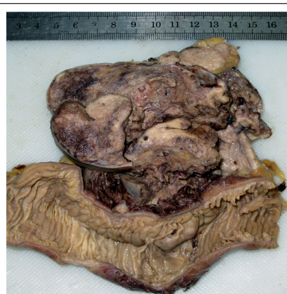
Figure 2 Gross examination of resected mesenteric mass. The mass was gray-tan solitary nodular mass without a fibrous capsule. The mass was observed to extend to the wall of jejunum and necrotic areas were also found.

Under microscopic examination, a part of the tumor was surrounded by a thin fibrous pseudocapsule at the periphery. The tumor was composed of cells with abundant clear to fine eosinophilic granular cytoplasm and round,