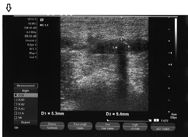
Figure 3. Gallstone-related abdominal abscess. Ultrasonographic study showing a gallstone in the abscess cavity with typical posterior shadowing.

device. Two stones were found and one was sent for pathologic examination. The other remained with the suction material. The cavity was irrigated with saline solution, and a 19-Fr Blake drain was placed in the most dependent part of the abscess. The pathology report of the stone described a single, medium, orange/tan irregular calculus, with a 44-mg mass and a size of 5 mm to 9 mm, that was composed primarily of cholesterol.