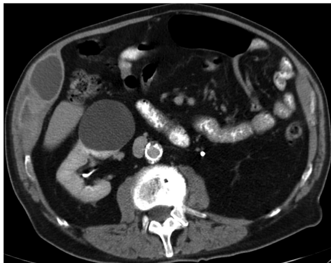
Figure 1. Gallstone-related abdominal abscess. Computed tomography depicting right flank fluid collection with surrounding inflammatory changes.