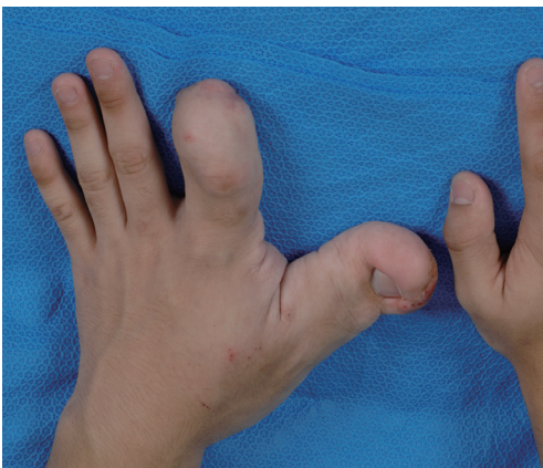
Fig. 3. Postoperative photograph. Postoperative photograph of the operated finger at the 2-month follow-up.

Differential diagnosis commonly includes neurofibromatosis type I, hemangiomas, lymphangiomatosis, Klippel-Trenaunay-Weber syndrome, fibrolipomatosis hamartoma of a nerve, and Proteus syndrome. Among these, the disease that is the most difficult to differentially diagnose from macrodystrophia lipomatosa is neurofibromatosis.