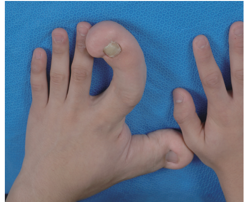
Fig. 1. Preoperative photograph. Preoperative photograph showing enlargement of the left thumb and index finger.

Plain radiographs of the patient's left hand revealed a marked increase in the thickness of the soft tissues, and the length and diameter of the corresponding metacarpals and phalanges were also increased. The