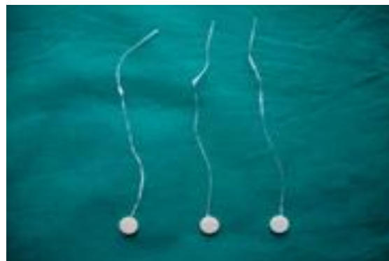
Fig 2. Dental floss incorporated into the tablets

Then the glass slide was removed and cured from below for 20 secs. The set discs were gently pushed out of the moulds. Each disc specimen was immersed in airtight polyethylene bottle containing 20ml of deionized water and incubated at 37°C and stored for 24 hours.