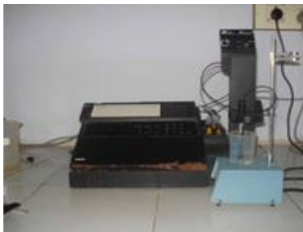
Fig 3. Fluoride ion selective electrode connected to an ion selective electrode meter

Fluoride release was highest on day 1 and there was a sudden fall on day 2 in all three groups. Fluoride release later increased up to day seven following which there was a gradual decrease (Fig 4).