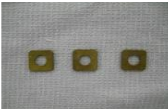
Fig1. Cylindrical brass moulds