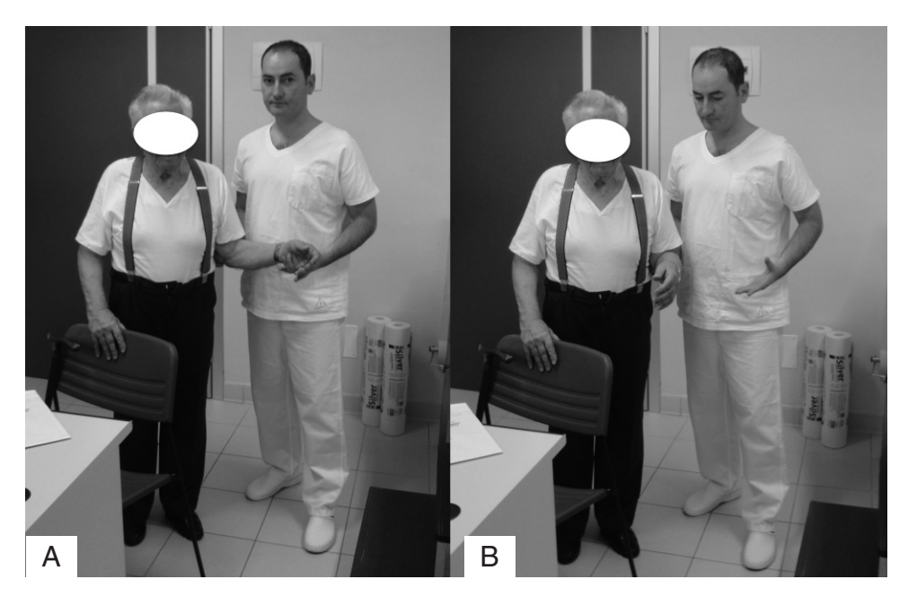
Figure 1 A-B - Clinical assessment of "drop sign". When the examiner place the shoulder at 45° of external rotation (A) and it drop back to 0° (B) the test is positive.