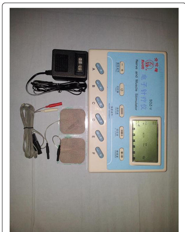
Figure 3 The SDZ-V nerve and muscle stimulator (Hwato, Jiangsu, China) and self-adhesive electrodes.

A German prospective observational study published in 2011 demonstrated an overall incidence of PONV in 47% of patients after craniotomy under general anesthesia [4]. The sample size is determined by using PEMS 3.1 with \alpha = 0.05 (two-sided) and \beta = 0.1 (90% power). In order to demonstrate a 30% absolute reduction in the incidence of PONV, the sample size will be 49 patients for each group. Considering the potential loss and attrition, 60 patients