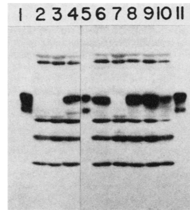
FIG. 3. Western blots of spe-1 mutant extracts. Similar amounts of protein were loaded onto the gels. The position of wild-type ODC is shown by the arrow. Lanes 1, 5, and 11: purified wild-type ODC. Lanes 2, 3, and 4: spe-1 + strain (IC-3) grown on spermidine-containing medium, minimal medium, or medium containing 1 mM arginine, respectively. Lanes 6 and 7: strain IC-46 (carrying spe-1 allele PE85) grown in medium containing 1 mM spermidine or minimal medium, respectively. Lanes 8, 9, and 10: strains IC-37, IC-41, and IC-9, carrying alleles 462JM, 521KW, and TP138, respectively, displaying no ODC activity (grown on a suboptimal concentration [0.2 mM] of putrescine). The autoradiographic exposure shown here does not show the small amount of labeling in extracts of mycelia grown in minimal medium (lane 3) and in the presence of spermidine (lanes 2 and 7). Longer exposures and direct counting both show that labeled material is present at levels of one-eighth (minimal) to one-fifteenth (spermidine grown) that seen in polyamine-deprived cultures of IC-40.

mutations, it was later found that the Whitney and Morris spe1A mutation does not complement with the spe10 mutation (25). Finally, the structural gene of Saccharomyces cerevisiae has been cloned, and shown to be a unique-sequence gene (9). The cloned DNA complements the spe1A mutant isolated by Whitney and Morris (27), as well as being expressed in an ODC-less Escherichia coli mutant (9). It is very likely, therefore, that the spe1A and spe10 mutations represent the structural gene for the locus of yeast.