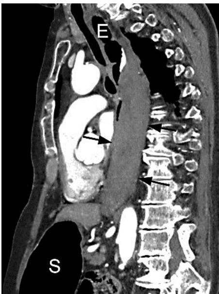
Fig. 2. Chest CT: obstructive esophageal mass located in the median and lower part of the esophagus in sagittal reconstruction. E = Esophagus; S = stomach.