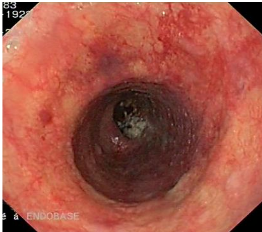
Fig. 3. Upper gastrointestinal endoscopy: large obstructive blue lesion in the esophagus extending from 22 to 36 cm distal from the incisors.