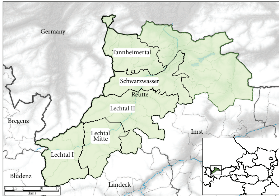
FIGURE 1: Study area and hunting plots. Five named hunting plots were defined within the District of Reutte (green area) in the province of the Tyrol, Austria. The study area has a border to Germany (Bavaria) in the north, to the Austrian province of Vorarlberg in the west (districts of Bregenz and Bludenz, respectively), and to other Tyrolean districts in the south.