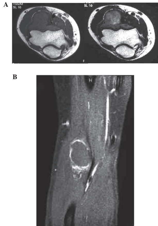
Figure 2. (A) Magnetic resonance image showing the tumor located between the brachioradialis and brachialis. The signal intensity of the tumor was isointense to muscle on T1-weighted images (left) and hyper- or isointense to muscle on T2-weighted images (right). (B) On gadolinium-enhanced magnetic resonance images, the margin of the tumor was well-contrasted.

PVNS shows the same radiodensity as that of soft tissue. The disease causes contour erosion of the underlying bone or round lytic areas with well-demarcated borders, which are observed particularly at points of capsular insertion (17). MRI strongly supports the diagnosis of PVNS through the