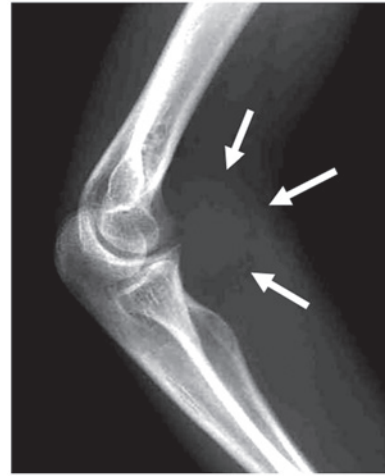
Figure 1. Radiograph showing a soft tissue mass (arrow) on the right elbow, with no apparent bone erosion.

A literature review identified only 24 documented cases of PVNS involving the elbow joint; of these, 15 were case reports and nine were included in seven large retrospective PVNS series of all sites: one case from Scott (8), one from Granowitz et al (2), two from Docken (5), one from Pandey and Pandey (15), one from Miller (14), one from Ushijima et al (11) and two from Schwartz et al (4) (Table I). In the seven large retrospective PVNS series, LPVNS comprised 246 and DPVNS comprised 78 of the 421 cases. There were no details of the remaining 97 cases. In past reports of PVNS involving the elbow joint, five cases of LPVNS (18,19) and 17 cases of DPVNS were identified, in which this information was available. Gender was reported in 16 of 24 cases; there were four males and 12 females. Reported ages ranged from 6 to 61 years, with a mean age of 33.9 years in the 18 cases for which this information was available (2-22).