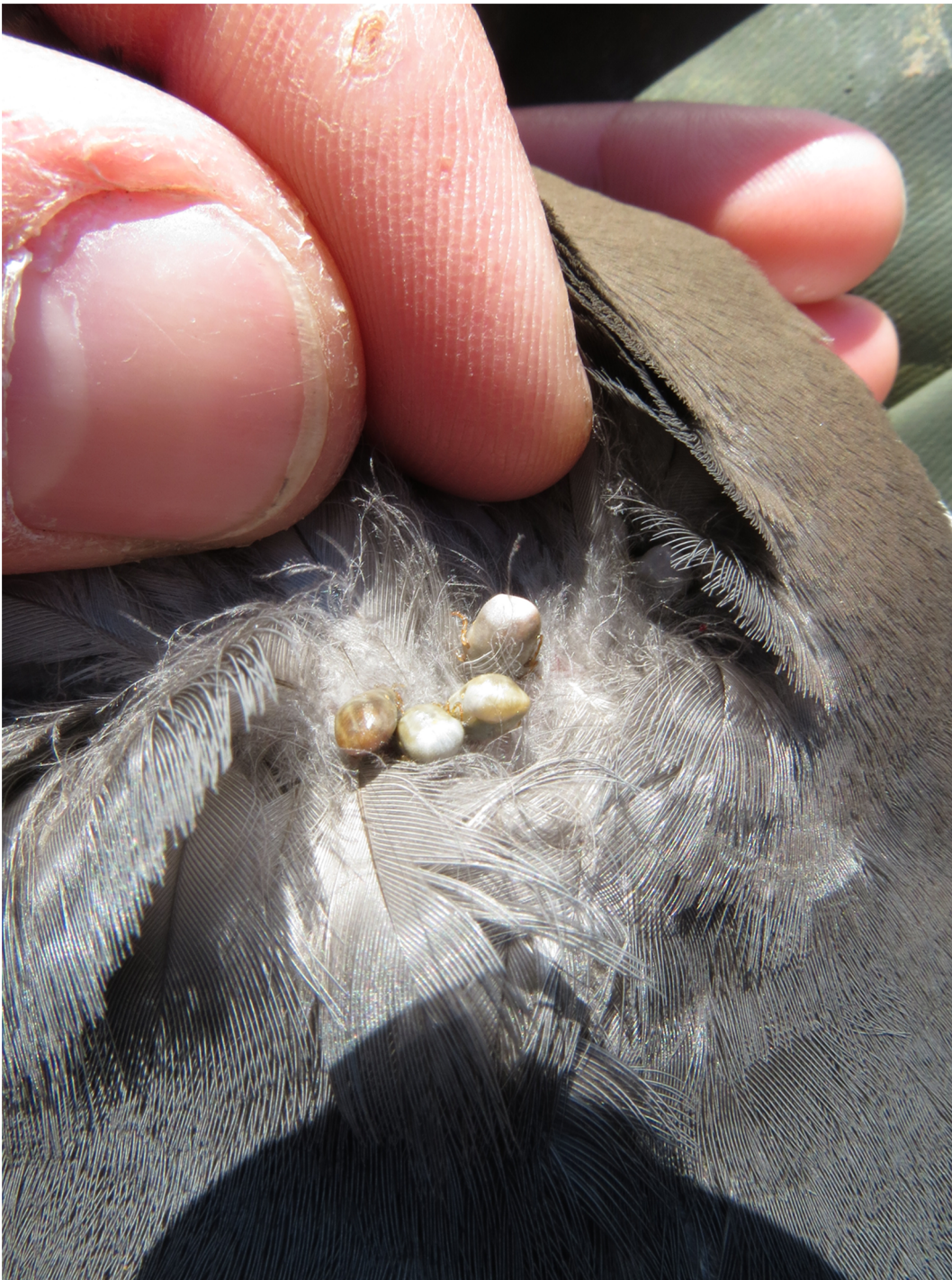
Figure 1. Engorged ticks Ixodes uriae on the neck of a Brünnich's guillemot, Ossian Sarsfjellet colony, Svalbard.