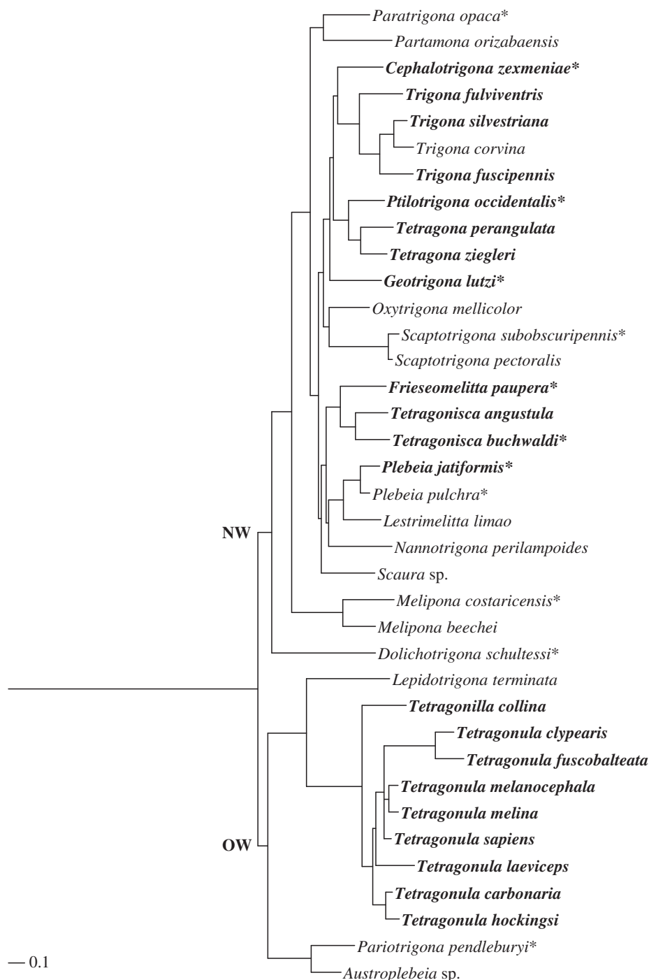
Figure 1. Phylogeny of 37 stingless bee species (adapted from Rasmussen & Cameron [30]). The upper branch comprises all the species from the New World (NW: here restricted to Central America), whereas the lower branch comprises all Old World species (OW: here restricted to Borneo and Australia). Bees marked in bold represent species with significant amounts of resin-derived compounds (greater than 20%) in their cuticular profiles (see the electronic supplementary material, table S1). Asterisks indicate species for which closely related species were used for chemical and phylogenetic analyses. Tetragonula davenporti , Austroplebeia australis and Austroplebeia cincta are not displayed.

correlated with the species' phylogenetic age. Age was estimated from the complete Bayesian phylogeny using penalized likelihood implemented in r8s 1.71 [55] with the Liotrigonopsis age fixed at 44.1 Ma, as in Rasmussen & Cameron [30]. We controlled for multiple testing using a false discovery rate (FDR) correction of p -values. All analyses, except when noted, were performed in R [56].