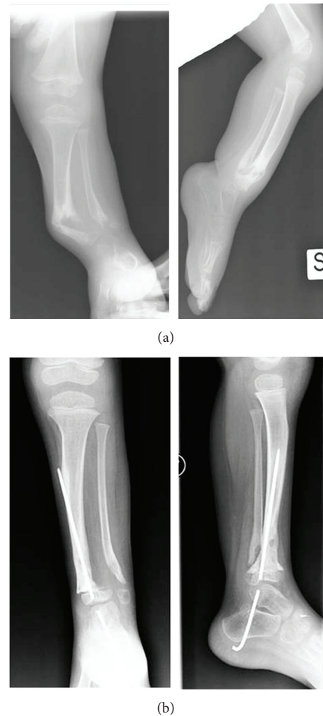
FIGURE 2: Clinical effect of the use of combined BM hMSC-based technique. Radiographics of a representative patient affected by NF1 with a tibial pseudarthrosis before (a) and three months (b) after the use of autologous BM hMSCs combined with platelet-rich fibrin and lyophilized bone.

Cartilage is vulnerable to injury and has poor potential for repair. However, unlike bone, cartilage regeneration remains elusive. Procedures devoted to recruit stem cells from BM by penetration of the subchondral bone have been widely used to treat localized cartilage defects [111–113]. More recently, autologous chondrocyte implantation, alone or in combination with MSCs, has been introduced [111]. The use