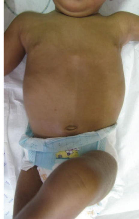
FIGURE 1: Irregular pattern of hypopigmentation area on the right side of the abdomen, not following the Blaschko lines.

There are 35 reported cases of mosaic trisomy 18, of which 33 were included on a review in a recent publication [4] and two were reported since then [5]. The age and clinical circumstances at diagnosis were considerably variable, with 15 cases being diagnosed in adulthood, 11 cases between two and 18 years of age, and only nine cases under the age of two years, of which only three were diagnosed in the first year of life [4, 5]. One of them was 10 months old, presenting with failure to thrive, developmental delay, and dysmorphic features. He was the second of a pair of siblings with mosaic trisomy 18 [6]. The other two patients were both diagnosed in the neonatal period: one of them had multiple congenital anomalies and was initially diagnosed as complete trisomy