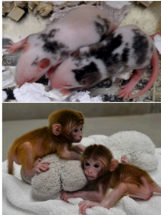
Figure 2. Mouse and rhesus monkey chimeras

Upper Panel: mouse chimeric pups produced with iPSCs in the Mitalipov laboratory (unpublished results). iPSCs were derived by transduction of skin fibroblasts isolated from C57Bl/6 (black) strain with lentiviral vectors carrying Yamanaka's reprogramming factors (Oct4, Sox2, Klf4 and c-Myc). To evaluate developmental competence, approximately 8–10 isolated iPSCs were injected into cleaving 4–8-cell embryos from ICR (albino) mice and transplanted into recipients. Note black coat color spots in offspring demonstrating contribution of iPSCs to chimeras.