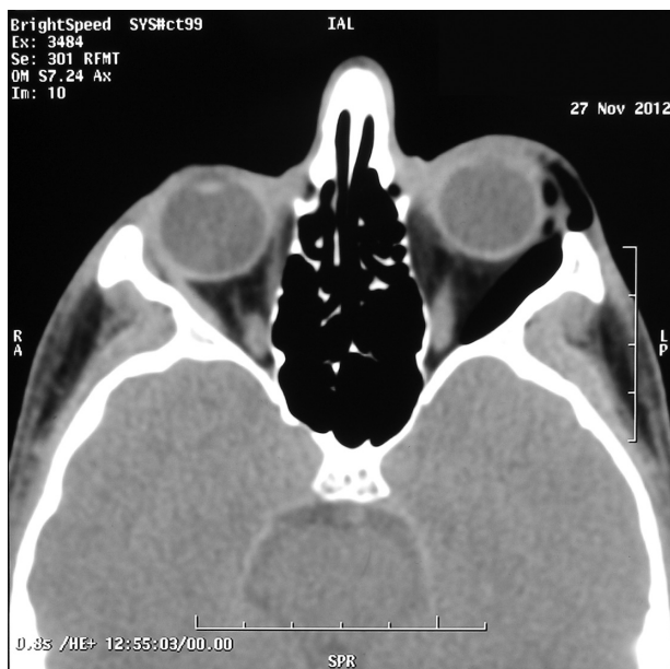
Figure 2 Left lower lid subcutaneous emphysema, lateral subconjunctival emphysema, and orbital emphysema.

Orbital emphysema most often results from a fracture of the orbital wall that allows air to enter the orbit from the paranasal sinuses. 5 The presence of orbital, subconjunctival, and subcutaneous emphysema may be due to air from the nasal cavity entering between the loose tissue planes of the orbit after fractures of the orbital walls. 3 Subconjunctival emphysema can be explained by probable communication between the subcutaneous and subconjunctival planes 6 or the probable