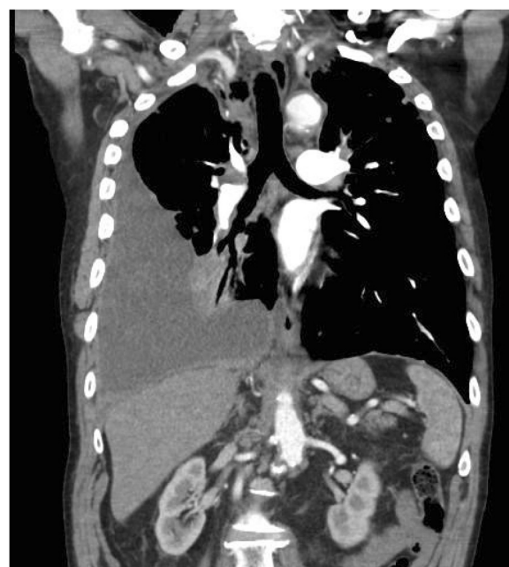
Figure 1 Chest computed tomography scan confirming a large, right-sided pleural effusion in the setting of metastatic papillary thyroid carcinoma, prior to drainage and pleuroscopy.

Medical thoracoscopy revealed multiple areas of tumour deposits on the parietal and visceral pleura, clearly shown in the additional movie file (see Additional file 1). Many of the tumour nodules had the same