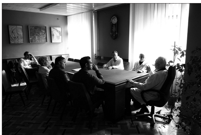
Figure 1: Photograph of meeting with administration to discuss feasibility of potential surgical missions during a site evaluation in Kiev, Ukraine 2004

The site evaluation is also the ideal time to meet not only with the host neurosurgeons, but also with the hospital administration that must permit and promote the mission effort [Figure 1]. To complete a week of a dedicated neurosurgical mission with multiple operation dates, administrative support is critical for the cooperation of other surgeons in relinquishing operating days and preparing nurses for the increased case volume and postoperative nursing requirements. Ultimately, the on-site evaluation and face-to-face meeting allow assessment of personal and logistical elements.