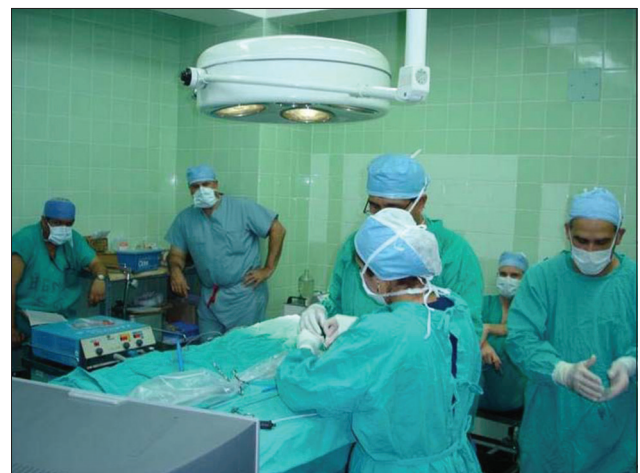
Figure 4: Photograph taken during last surgical mission of visiting surgeon standing un-scrubbed in corner of operating theater with primary and assist surgical roles undertaken entirely by host neurosurgeons