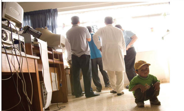
Figure 2: Photograph of potential case list prepared by host surgeons during inaugural mission in Lima, Peru 2003. Patients that were considered were evaluated in clinic and discussed during day one of the inaugural mission to collectively decide indications and process for undertaking planned surgical intervention