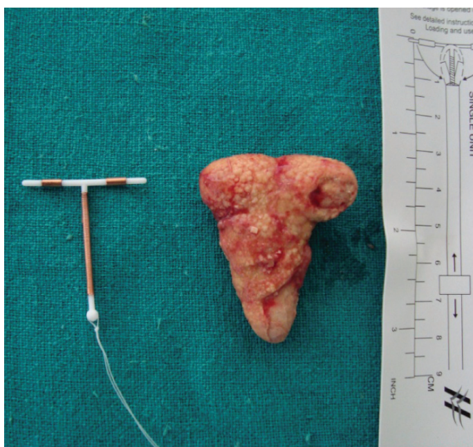
[Table/Fig-2a]: Showing the vesical calculus ACu-T 380A is placed alongside for comparison

The calculus was removed through a suprapubic cystolithotomy [Table/Fig-2a and 2b] and the patient was discharged on the 7 th postoperative day.