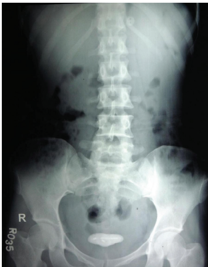
[Table/Fig-1b]: X-ray abdomen showing an intravesical calculus with an IUCD inside it