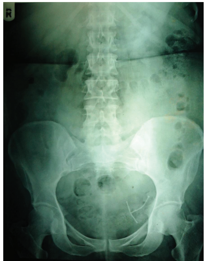
[Table/Fig-1a]: X-ray abdomen showing misplaced IUCD in sigmoid colon

The patient had a soft abdomen, with regular bowel habits. She had no other complaints. An X-ray of her abdomen revealed an intravesical calculus, inside which the metallic arms of the copper-T were distinctly visible [Table/Fig-1b]. The diagnosis was confirmed after the cystoscopic visualization of a free floating calculus in the urinary bladder. There were no tell-tale signs which would suggest an intravesical copper-T emigration.