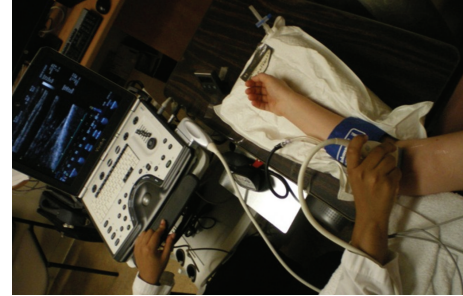
FIGURE 1: Setup of FMD studies showing proximal manual probe holding technique and distal cuff position.

2.2.1. Subject Preparation. Subject preparation for brachial artery FMD studies followed established guidelines [26]. All subjects were studied after abstaining from alcohol, cigarette smoking, exercising for 12 hours, and after an overnight fast (minimum of 8 hours). In addition, subjects were asked to abstain from vitamins for 24–48 hours. An attempt was