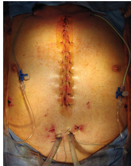
Figure 2: Primary wound closure with single sutures.

Alternatively, in cases of sternal instability with limited signs of infection, the suction irrigation drainage may be spared.