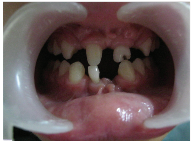
Figure 4: Intraoral photograph revealing multiple missing and malformed teeth in both maxillary and mandibular arches