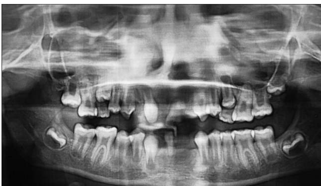
Figure 5: Orthopantomogram showing missing teeth i.r.t 12,22, 31,32,41,42 and retained deciduous tooth i.r.t 81

Intra-oral examination along with panoramic radiography revealed multiple missing teeth (12, 22, 31, 32, 41, 42) in mandibular and maxillary anterior region and a retained mandibular deciduous incisor (81) [Figures 4 and 5]. Maxillary central incisors (12, 21) were malformed and 21 had a deep carious labial fissure. Multiple frenulum and labiogingival