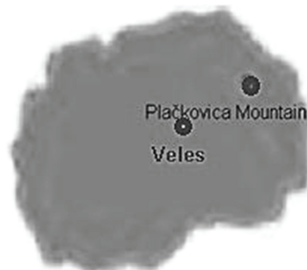
FIGURE 1: City of Veles and Plačkovica Mountain as sampling areas.

2.4. Genomic DNA Isolation. Frozen plant samples were used for DNA isolation. 0.5 to 0.7 cm disks of leaf tissue were catted with standard one-hole paper punch. Samples were kept on ice, while the procedure was done. DNA extractions were performed using REExtract-N-Amp Plant PCR Kit (Sigma-Aldrich) following the instructions of the manufacturer. Plant disk was placed into a 1.5 mL microcentrifuge tube with 100 μL extraction solution and incubated for 10 minutes at 95°C. 100 μL of dilution solution is added and vortexed. Extract is stored at 2–8°C until use.