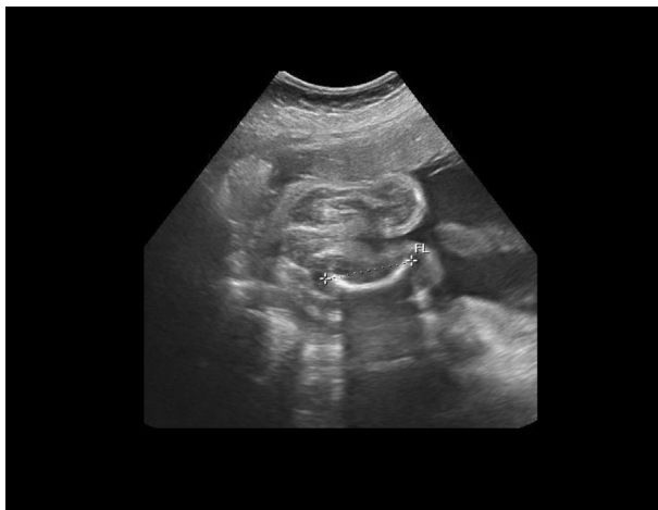
Fig. 2. Prenatal ultrasound at 22 weeks showing bowing of the femur (the crosshairs show the extremities of the femur).

scoliosis. Surgical resection of dislocated radial heads were performed in 2 patients from the same family (patients 2 and 3) with only marginal improvements noted in elbow range of motion and no increase in range of motion at the wrist. There was no HPC formation following rodding or other orthopedic surgeries in our cohort.