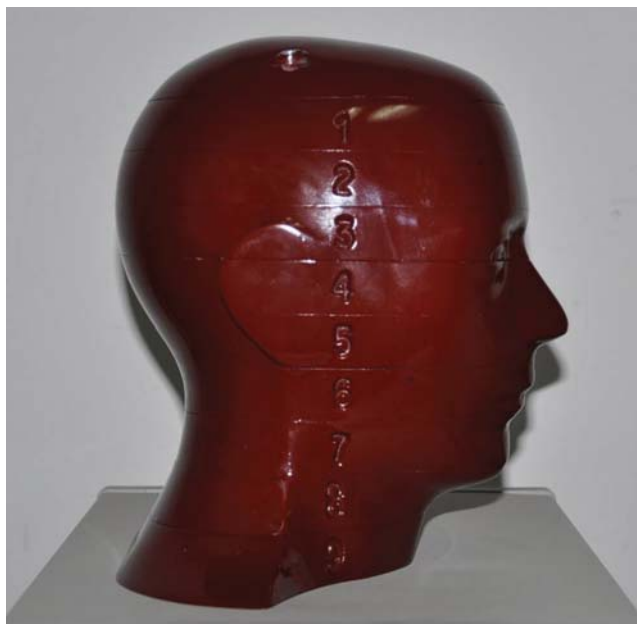
Fig. 1. The image of one anthropomorphic phantom.