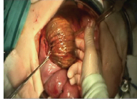
FIGURE 4: Another view of invagination of the efferent loop to the stomach.

reported a case of JGI in a patient with a history of Billroth II resection [4]. According to the type of intussuscepted loop, JGI is classified into three types: type I, antegrade or afferent loop intussusception; type II, retrograde or efferent loop intussusception; and type III, combined form [5]. Efferent loop JGI is seen in 80% of the cases as in the present case, while others account for the remaining 20% [5]. The exact mechanism of JGI is still not well understood. Long afferent loop, jejunal spasm with abnormal motility, increased mobility of the efferent loop, and adhesions leading to the intussusception of a more mobile segment into a fixed segment may be the underlying causes [1]. It is also postulated that increased intra-abdominal pressure, a dilated atonic stomach especially after vagotomy, and retrograde peristalsis may be responsible for the development of JGI [1].