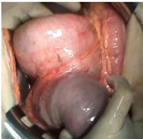
FIGURE 3: Invagination of the efferent loop to the stomach.