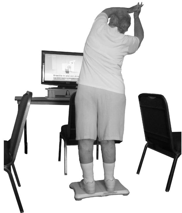
Figure 2 Participant performing the half moon pose during one training session.

After completing the balance tests, participants in the experimental group completed training using the Wii Balance Board with Wii Fit (Figure 2). Training occurred three times a week (Monday, Wednesday, and Friday) for 3 weeks. Each training session was one-on-one with a supervisor, lasted approximately 30 minutes, and was the same for all participants. All training was supervised, but no physical assistance was given to any participant. Chairs were placed in front of and to the left and right of the Balance Board for safety in case a participant lost balance. The intervention consisted of a series of exercises and activities chosen from the yoga (half moon, chair, warrior), aerobic (torso twists), and balance games (soccer heading, ski jump) modes. The specific order of the training was half moon, chair, warrior, torso twists, followed by two rounds of the soccer heading and ski jump, and finished with a repeat of the half moon, chair, warrior, and torso twists. Although the training program was not varied between individuals or within individuals throughout the intervention, all participants were challenged consistently. All participants in the experimental group were novices with Wii Fit prior to training, and as such there was room for improvement after beginning training. The consistent challenge was observed with the participants