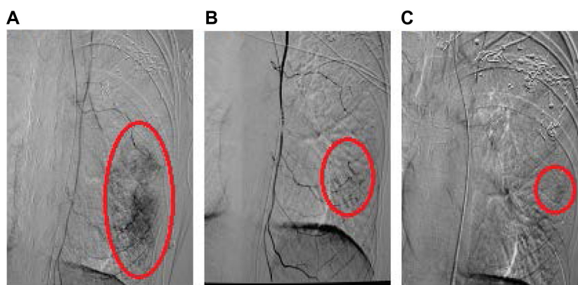
Figure 4 Digital subtraction angiography of the left internal mammary artery. Notes: (A) Digital subtraction angiography of the left internal mammary artery reveals a tumor mass with an approximate diameter of 11 cm in a patient with stage 3B breast cancer after breast-preserving surgery before intraarterial chemoinfusion. The tumor mass is adherent to the chest wall and is immobile, as indicated by the red oval. (B) The tumor mass has shrunk after the second intraarterial chemoinfusion, as indicated by the red oval. (C) The tumor mass has shrunk further after the third intraarterial chemoinfusion, as indicated by the red oval.

Breast cancer has rich arterial supply, which lends itself to chemotherapy by intraarterial infusion. High concentrations of chemotherapeutic drugs reach the tumor interior via the feeding arteries, reaching a level two to ten times higher than that of adjacent tissues. Furthermore, direct contact of drugs with tumor cells more readily promotes apoptosis of tumor cells and inhibits tumor cell proliferation, thus lessening the metastasis and recurrence of the primary lesion. Intraarterial chemoinfusion for breast cancer can be traced back to the 1960s and is a form of regional chemotherapy that can readily achieve high local concentrations with fewer side effects. In the present study, 28 patients received a total