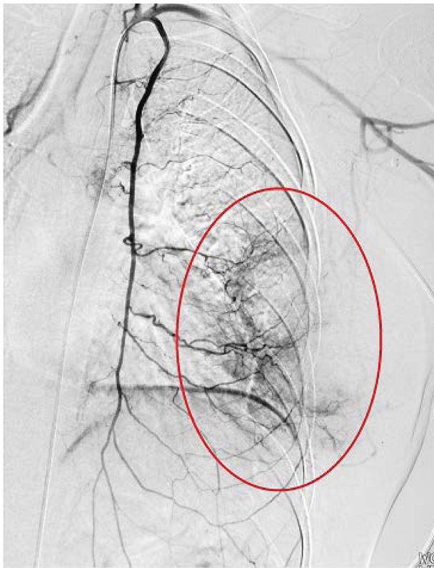
Figure 1 Digital subtraction angiography of the left internal mammary artery. Notes: Digital subtraction angiography of the left internal mammary artery reveals the extent of the tumor, with an approximate diameter of 9 cm supplied by multiple branches of the internal mammary artery. The tumor appears patchy, as indicated by the red oval.

Chemotherapeutic drugs were allocated and infused according to DSA manifestations and tumor blood supply. Twenty-eight patients received a total of 64 intraarterial chemoinfusions, 20 patients (71.4%, 20/28) received two infusions, and eight patients (28.6%, 8/28) received