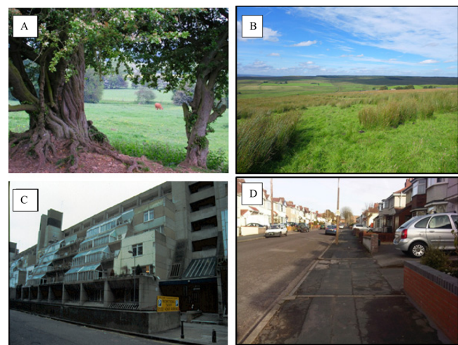
Figure 1. Examples of images used in the slideshows to depict scenes of nature environments (A and B) and scenes of built environments (C and D).

Scenes of Nature and Built Environments. The slideshows depicting scenes of nature and built environments involved still photographs representing each of the environments. The photographs were chosen from a central pool of photographs used within the research group. 15,16 The photographs (Figure 1) depicting natural environments included natural elements, e.g., trees, grass, or plant life, and were devoid of any man-made structures, e.g., buildings, vehicles, roads. In contrast, the photographs depicting built environments contained man-made structures, e.g., houses, flats, office