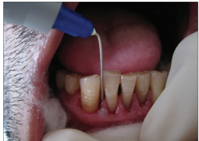
Figure 2: Insertion of metronidazole gel