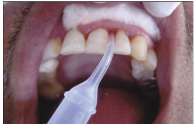
Figure 1: Insertion of minocycline microspheres

The mean plaque index for all three treatment groups at baseline was 2.46 \pm 0.54 whereas the mean value at 1 and 3 months were 1.06 \pm 0.29 and 0.71 \pm 0.25 respectively. There was significant reduction in plaque index scores at both 1 month and 3 months interval [Table 1]. The mean gingival index at baseline was 1.92 \pm 0.55 , whereas the mean value at 1 and 3 months was 0.98 \pm 0.30 and 0.73 \pm 0.19 , respectively. There was significant reduction