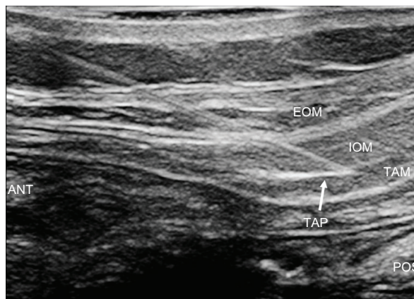
Figure 1 An ultrasound image of needle tip in the transversus abdominis plane (TAP) between the internal oblique muscle (IOM) and the transversus abdominis muscle (TAM) prior to injection. The external oblique muscle (EOM) is also well visualized.

Following the initial CT scan, the needle was left in place and extension tubing with a syringe containing the dilute iodinated contrast agent was connected to the needle. Maintenance of needle position in the TAP layer was verified