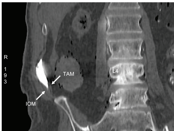
Figure 2 A coronal CT slice at the lumbar region demonstrating the spread of 5cc contrast material injected under ultrasound guidance into the transversus abdominis plane between the internal oblique muscle (IOM) and the transversus abdominis muscle (TAM).

As described in prior studies, there exists a difference in spread when a TAP block is performed under ultrasound guidance, versus a nonguided approach to the triangle of Petit. 13 We chose to perform the injection using ultrasound guidance, with the goal of accurately measuring injectate