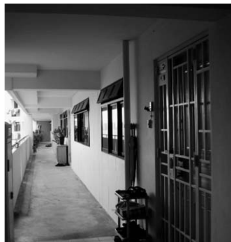
Photo 1. An open corridor in an apartment complex.

The next field of investigation was a nearby housing complex of affordable public high-rise apartment buildings. These public apartments are home to multi-racial residents, and each building of an apartment complex has several units on each floor (Photo 1). If the residents are not available