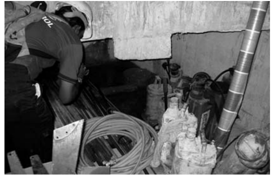
Photo 7. The NEA pest controller reaches into the bottom of the hidden place to inspect the areas where materials are kept on the ground floor.