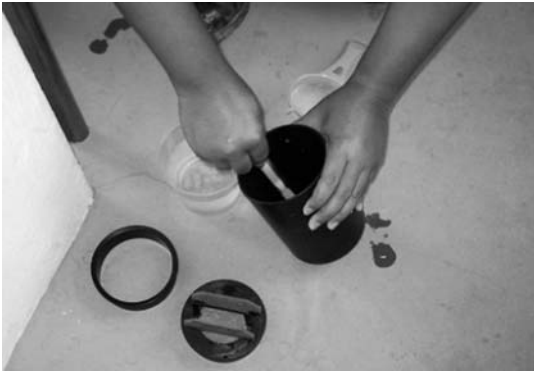
Photo 6. A complete ovitrap set: container, stopper, and float with paddles.