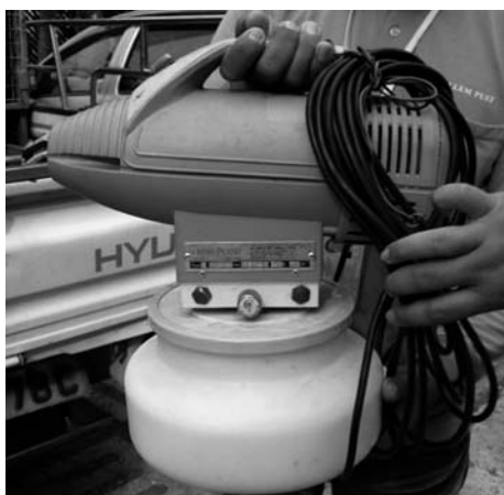
Photo 9. Pesticide (white color) is stored at the bottom of the ULV misting equipment.

During one time-consuming operation, we checked inside the room for mosquito breeding sources, and covered open food and/or drinks before applying the insecticide. The rear portion of each room was crowded with clothes, suitcases and other personal belongings, making it difficult to move between beds and lockers during the ULV application in each room. The operation team consisted of two contract workers with a supervising NEA officer. One worker wearing a thick protective mask used the applicator machine followed by another worker handling the long electric