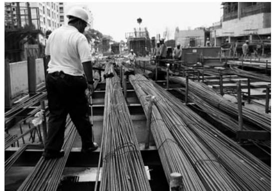
Photo 8. Metal rods used to strengthen cement walls. Private in-house pest controllers are likely to miss this area because of the unstable foothold.

We visited a construction site where a private condominium complex comprising five 19-story buildings with four units on each floor was being built. The purpose of this visit by a team of two NEA officers and one pest controller hired by the NEA was to investigate places that might have been overlooked by the in-house pest control unit working for the contractor. The NEA officers started inspecting from the top floor, walking down one floor at a time and going through each unit before reaching the ground floor. Construction sites are treated with special caution because they are areas with a high potential for mosquito breeding in Singapore. Indeed, inherent conditions including water barrels placed on each floor to use when mixing cement exist in addition to water puddles created inside the units by the frequent tropical rain showers. A number of spots were hidden by materials stored on the ground floor (Photo 7, 8). The in-