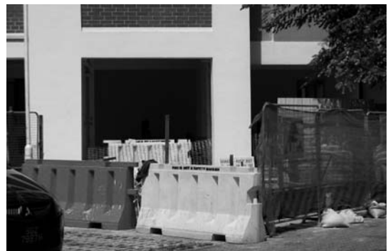
Photo 5. Safety barriers served as breeding sites for mosquitoes.