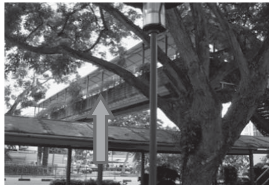
Photo 4. Flower pots along the walk bridge can be sources of mosquito breeding.

The NEA officers must pay additional attention to the different design and structure of each apartment complex. The residents of a particular complex we visited place numerous flower pots and planters along common corridors. Hence, black plastic oviposition traps (ovitrap) are placed in the corridors. An ovitrap is a monitoring tool that forms part of the NEA's preventive surveillance regime. Checking them weekly is labor-intensive but enables the NEA to determine the prevalence and species of mosquitoes. Ovitrap attract a female mosquito to lay her eggs on the wooden paddle hatch of a water-filled cylinder container. The eggs fall through a wire mesh and develop into adults, but the adult mosquitoes are trapped inside the container, unable to escape through the mesh (Photo 6). Although the number fluctuates depending on the season, 2,000 to 3,000 ovi-traps are deployed in areas at high risk across the country to monitor Aedes mosquito behavior. The geographical distribution of mosquito breeding sites is captured on geographical information system (GIS) maps for planning and analytical purposes. This strategy enables the NEA to preemptively remove mosquito breeding habitats in many areas even before cases of Dengue virus infection materialize.