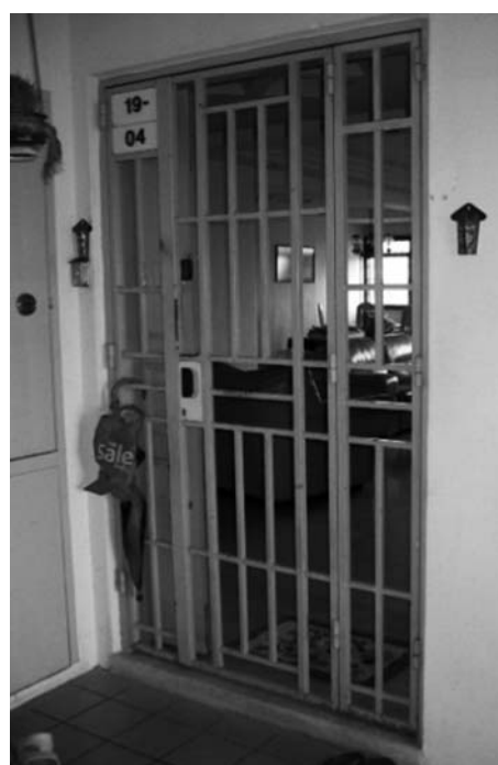
Photo 2. The gate door is locked while the main front door is left open for air circulation.

during the day, the NEA makes appointments in the evening. As Photo 2 shows, residents of the tropical city-state of Singapore sometimes leave front doors open, while keeping metal or wooden gate doors locked, for air circulation. Since the corridors are in the outside open air, keeping the environment free of mosquitoes is an important prerequisite for the prevention of mosquito-borne infectious diseases. When the inspector realized that one resident was an aged Chinese Singaporean with a poor command of