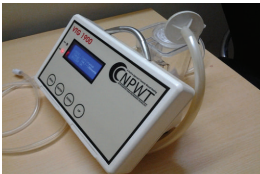
FIGURE 4: The connecting tube was connected to the negative pressure wound therapy.

which pump was on for five minutes and off for two minutes (Figure 4).