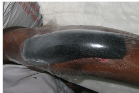
FIGURE 2: Sterile drape was applied covering the foam and 2-3 cm of the surrounding skin.