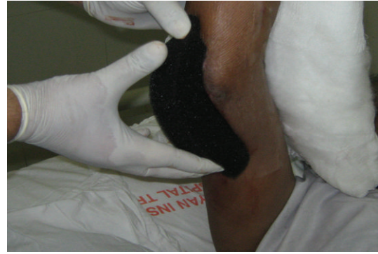
FIGURE 1: Foam was cut according to wound size.