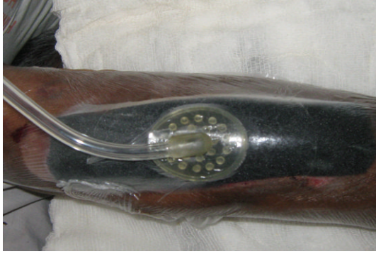
FIGURE 3: The connecting tube was applied after making a small opening (3-4 mm) on the drape.