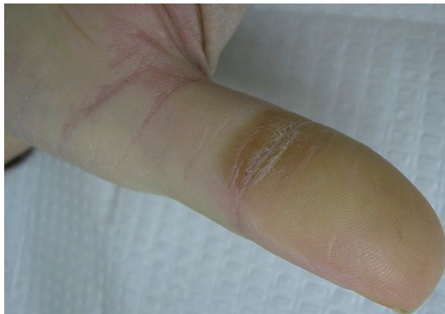
Figure 9 Hyperkeratotic plaque on thumb from regorafenib

start oral isotretinoin. If the practitioner is uncomfortable prescribing or managing treatment with oral isotretinoin, referral to a dermatologist with knowledge of EGFR inhibitor induced cutaneous toxicities may be beneficial for the initiation of treatment.