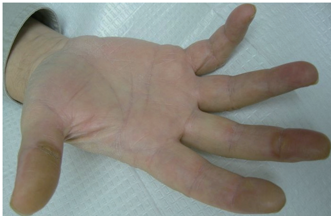
Figure 8 Hyperkeratotic plaques on areas of friction from regorafenib