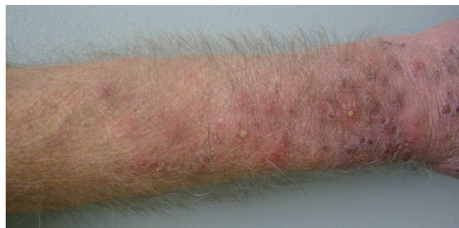
Figure 7 Cutaneous bacterial superinfection during EGFR inhibitor treatment

Cutaneous superinfections can complicate the cutaneous toxicities affecting patients treated with EGFR inhibitors (Figure 7). Several studies have been conducted to explore the microbiology of these infections. Amitay-Laish et al. studied 29 patients on EGFR inhibitors cetuximab or erlotinib and found that 24 patients had a papulopustular reaction (21). They divided this cohort into two groups based on when they developed the papulopustular eruption. The early phase group contained seventeen patients and had a median onset at 8 days. The late phase group had a median onset at 200 days and contained seven patients. Staphylococcus aureus was found in 7 of 13 early phase patients and in all 7 late phase patients. The high incidence of staphylococcal infection demonstrates the importance of bacterial cultures in the assessment and treatment of EGFR inhibitor eruptions. This study also emphasizes the importance of seeking a pathogenic microbial cause when patients who were stable on the EGFR inhibitors develop a late onset papulopustular reaction. Eilers et al. studied 221 patients treated with EGFR inhibitors and found that 84 showed evidence of infection at the sites of the cutaneous toxicity (22). Cultures revealed that fifty were