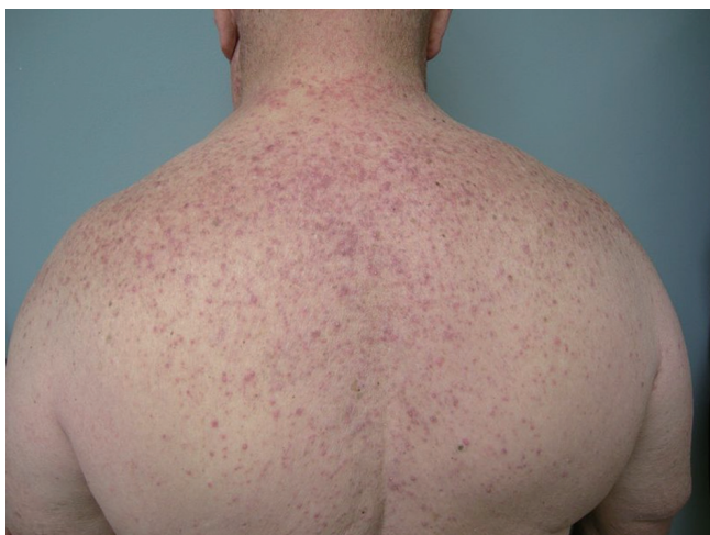
Figure 2 Acneiform rash affecting the back during EGFR inhibitor treatment