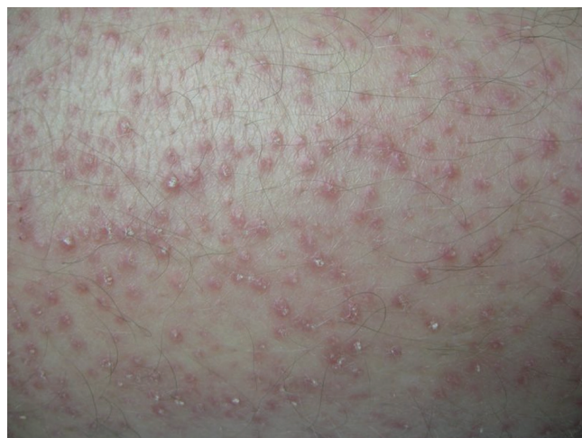
Figure 11 Follicular keratotic papules associated with multikinase-inhibitor treatment

Management of the HFSR can be challenging but the basic principles include minimizing friction and trauma with comfortable well fitting shoes and protective gloves. Topical corticosteroids can minimize inflammation and thickened hyperkeratotic plaques on the hands and feet can be softened with the use of keratolytic creams such as urea or lactic acid. Dose reduction of the regorafenib is another option for reducing the bothersome side effects. Unlike with the acneiform eruption seen with EGFR inhibitors,