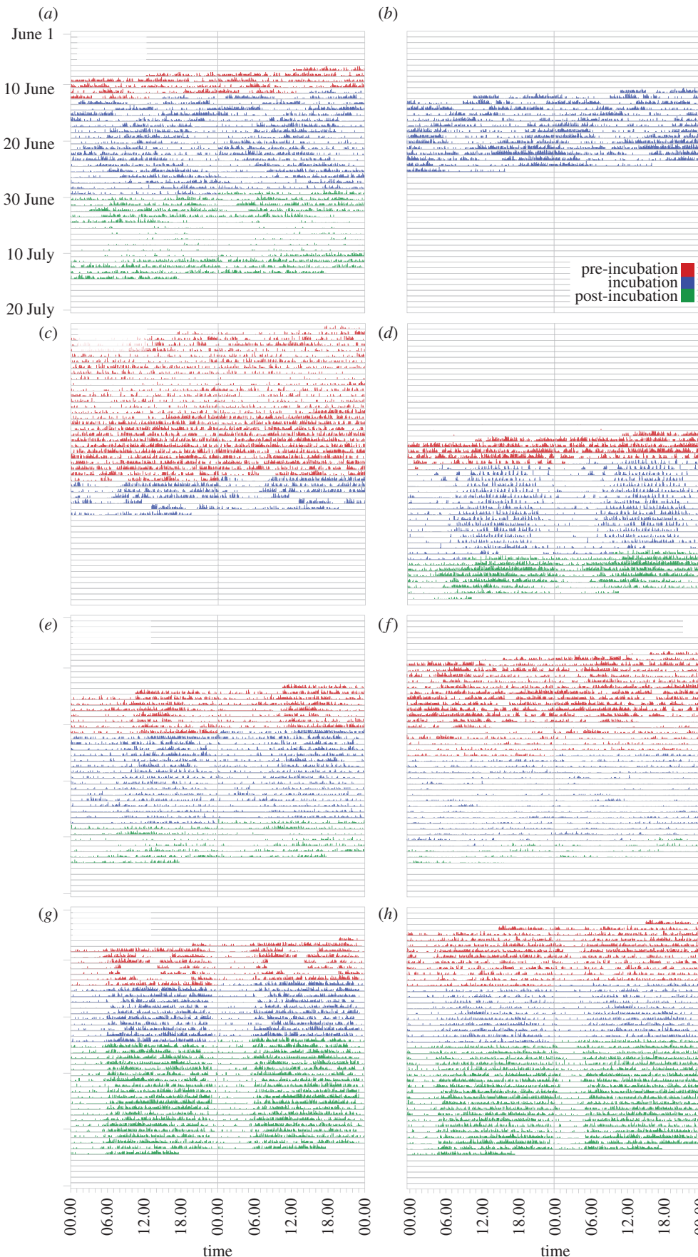
Figure 2. Actograms of males and females from four bird species breeding in Barrow, Alaska. (a) Male and (b) female semipalmated sandpiper Calidris pusilla (SESA) from the same nest. (c) Male and (d) female pectoral sandpiper Calidris melanotos (PESA). (e) Male and (f) female red phalarope Phalaropus fulicarius (REPH). (g) Male and (h) female Lapland longspur Calcarius lapponicus (LALO). Each actogram shows the activity records of one individual over a 24 h period, plotted twice, such that each row represents two consecutive days. Coloured regions indicate activity, whereby bar height is proportional to the amount of activity within a 5 min interval. Colour indicates breeding stage: pre-incubation (red), incubation (blue), post-incubation (green). Note that for male PESA and female REPH, breeding stage refers to the population breeding stage (i.e. 95% of individuals in the population incubating, or having offspring), and for male LALO it refers to the breeding stage of its mate (males do not incubate, but they do provision nestlings). Continuous activity data are only available for a few days for female REPH, because they left the male after the clutch was completed.